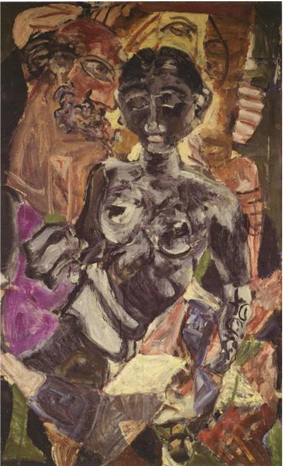
JUSTIN DARANIYAGALA (1903 – 1967) Oil Paintings